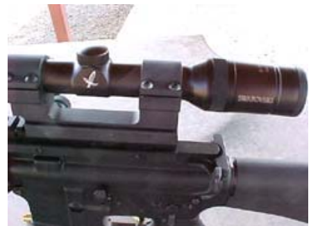
The flat-top receiver rail is perfect for mounting a quality scope sight such as the Swarovski 6x-18x variable, allowing the accuracy of the .50 Beowulf to be fully realized.