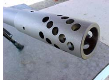
The Overwatch rifle features an effective and attractive muzzle brake.