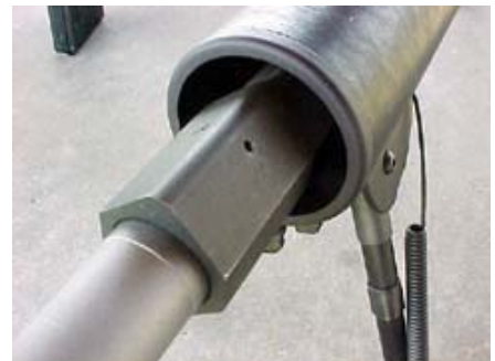
As an aid to accuracy, the Overwatch features a 24" free-floating stainless match barrel.